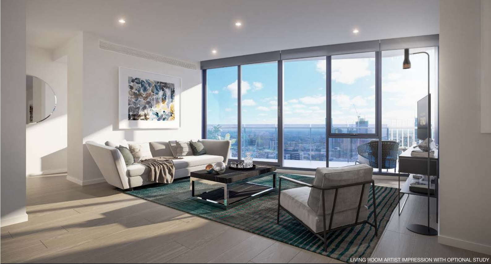
LIVING ROOM ARTIST IMPRESSION WITH OPTIONAL STUDY